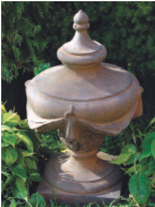
Statue This English finial measures 16x27x16 inches and has an acid washed in copper finish. Kansas City Art Statuary. (888) 261-3929. Write in 1407