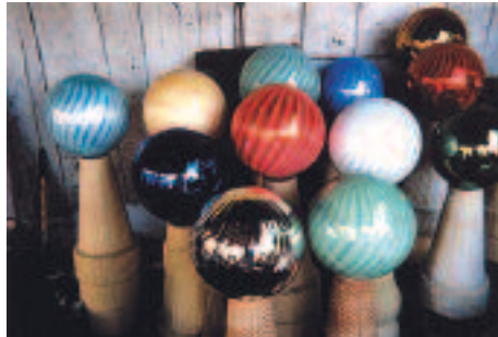
Gazing globes Gazing globes have evolved from metallic balls into transparent and semi-transparent jewels of color that can change with every season or new trend. The globes are available in 6-, 10- and 12-inch sizes. All colors are available, including reds, swirls and opals. Made in the United States. Punxsutawney Globes. (814) 938-4200. Write in 1415