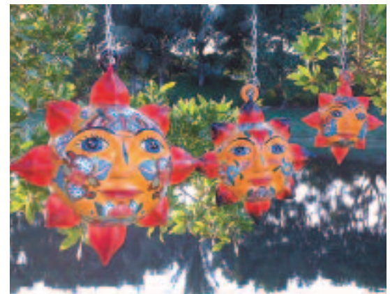
Wall hanging These new, colorful hand-painted Sphere Hanging Suns come in three different sizes: 8, 11 and 15 inches. Also, a new collection of wall Talavera Suns with wrought iron frames has been introduced for 2005. Both products come with an eclipse design version. Masart. (877) 9-Masart. Write in 1410