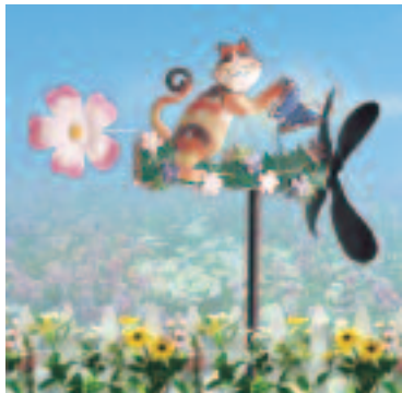
Whirligig This whirligig features a cat playfully pawing at a butterfly moving with the wind as it blows. It is made of metal with automotive paints to create a rust- and fade-resistant color finish that is multi-layered (12 colors) and applied by hand, giving a textured patina look. Available in six styles: cat, dog, songbird, hummingbird, frog and cow. Regal Art & Gift. (800) 681-3040. Write in 1416