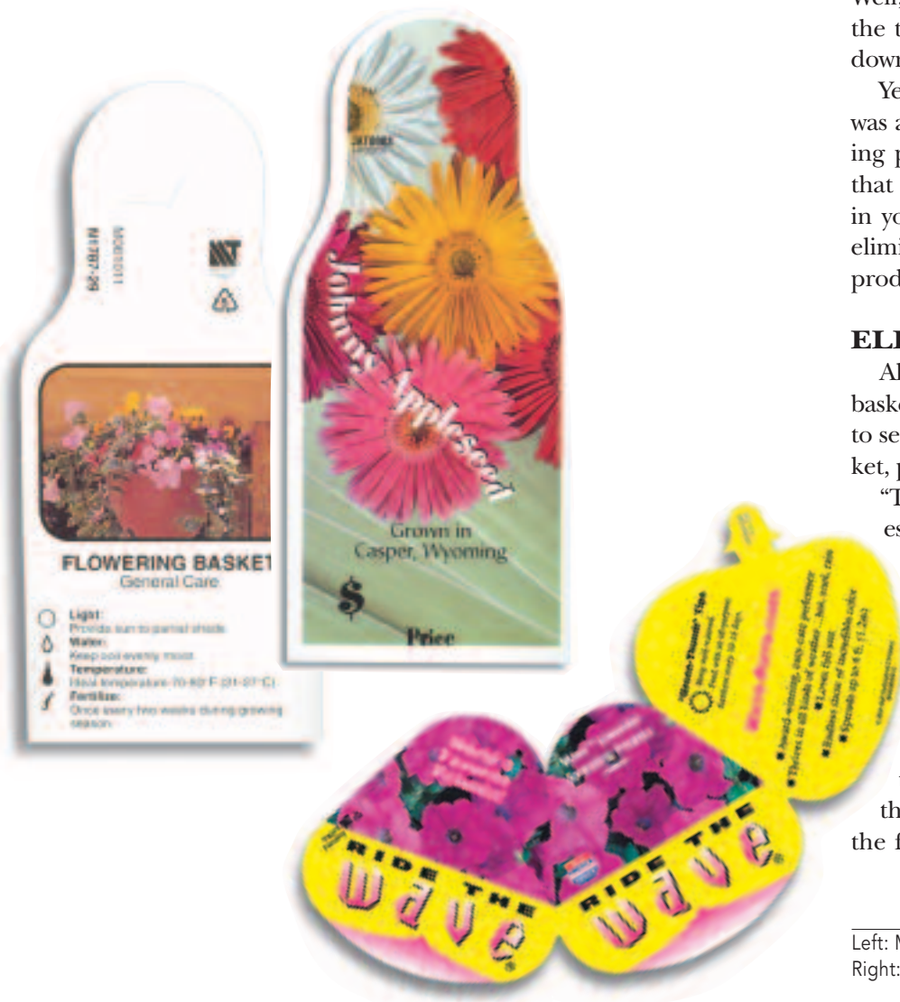
Left: MasterTag's Premium Hanging Label (left) and John Henry's Custom Hang-N-Tag (right); Right: MasterTag's Hanging Basket Collar

Collar Tags. New for 2003, MasterTag's Hanging Basket Collars provide information for consumers without hiding under mounds of product. Since it is placed around the wires, close to the hanger, it is clearly visible away from the product. Though it doesn't solve the problem of not being able to see it when displayed high up in the garden center, the collar has more space than other tags with three large sides, allowing more information to the customer both on the front and back. "It's always a challenge to put information onto a