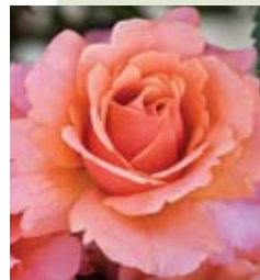
Rose 'Easy Does It' (Weeks Roses, www.weeksroses.com )

Attractive colors of mango orange, peach pink and ripe apricot bounce off the mirrored glossy green leaves, providing a bright fruit salad for the landscape. This rose's free-flowing swirling shades show up in fragrant large colorful clusters atop a rounded bushy plant. Disease resistant and vigorous, 'Easy Does It' will perform well in any climate.