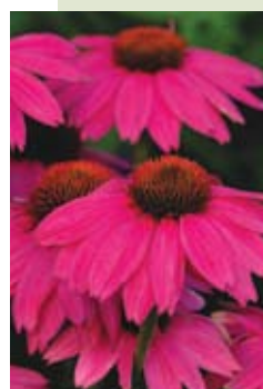
Echinacea 'PowWow Wild Berry' (PanAmerican Seed, www.panamseed.com )

This purple coneflower differs from all others for flower color, branching and plant size. Gardeners will love the deep rose-purple 3- to 4-inch flowers that retain color on the plant longer. Hardy to Zone 3, this first-year flowering perennial has superior performance including a basal branching habit, resulting in more flowers per plant. Reaching a height of 20-24 inches in the full sun garden, this winner blooms continually without deadheading.