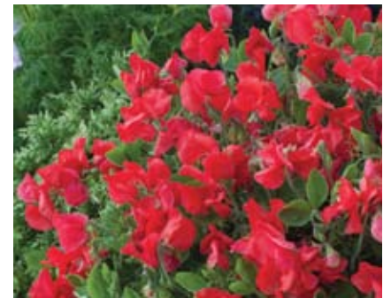
Lathyrus 'Villa Roma Scarlet' (Hem Zaden, www.hemzaden.com ).

'Villa Roma Scarlet' is the first Lathyrus odoratus to win the Fleuroselect Gold Medal, impressing judges with its innovative, bright color; overall attractiveness and excellent garden performance. Flowering profusely from July to September, this beauty is suitable for container gardening, hanging baskets and for full-ground direct sowing. The variety requires no staking or trellis work.