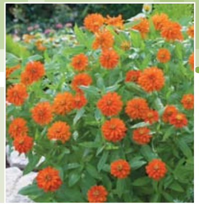
Zinnia 'Double Zahara Fire' (PanAmerican Seed, www.panamseed.com )

A double award winner this year (see page 12 for its previous mention), this exciting cultivar stunned judges with its beauty, disease resistance and garden performance. 'Double Zahara Fire' has been developed for use in mass landscape plantings in high light and warm temperate climates. It is a must for borders and containers. The unique color and large flowers will draw consumers.