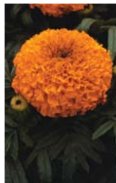
Marigold 'Moonsong Deep Orange' (Syngenta Flowers, www.syngentaflowers.com )

This purple coneflower differs from all others for flower color, branching and plant size. Gardeners will love the deep rose-purple 3- to 4-inch flowers that retain color on the plant longer. Hardy to Zone 3, this first-year flowering perennial has superior performance including a basal branching habit, resulting in more flowers per plant. Reaching a height of 20-24 inches in the full sun garden, this winner blooms continually without deadheading.