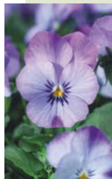
Viola 'Endurio Sky Blue Martien' (Syngenta Flowers, www.syngentaflowers.com )

AAS judges noted that this variety's intense, deep-orange flower color could not be captured by photo. The fade-resistant orange flowers make others look more golden than orange. This unique color is one of the plant's three desirable, improved traits. The flower size, from 2½ to 3½ inches, and fully double blooms rank among the best of its class. 'Moonsong Deep Orange' plants are vigorous, tolerating stress such as heat or drought. In the full sun garden, the erect plants will reach about 12-15 inches tall.