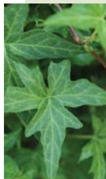
Hedera helix 'Ritterkreuz'

This ivy has obscurely five lobes, with two small basal lobes, sometimes appearing as teeth on the lateral lobes. The terminal and lateral lobes are angular, sometimes toothed and are broadest near the middle, giving an almost diamond shape to the lobes. Color is mid green with lighter veins. When planted outside, the color will become dark with a reddish cast in winter. This versatile ivy does well as a houseplant, can be used in all types of topiary and has been shown to be winter hardy up to at least Zone 6. It will climb low walls but is not particularly fast growing either on a wall or in the ground.