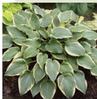
Hosta 'First Frost' (Scolnik, Solberg 2002)

A sport of 'Halcyon', 'First Frost' is a frosty, white-edged hosta. Blue leaves emerge with a wide margin that matches the wonderful color of the center of 'June', another 'Halcyon' sport and 2001 Hosta of the Year; the leaves turn pure white if grown in half a day of bright light. Lavender flowers bloom in July. It has excellent color and substance, and will look unblemished in the garden until "first frost."