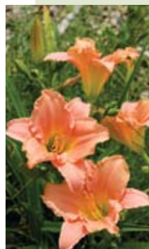
Daylily 'Toy Cameo'

'Toy Cameo' is a winner in the Landscape category because it packs powerful performance into a petite, proportioned plant. Its compact habit, graceful foliage, well-groomed appearance and repeat blooming habit make it a top choice in its color category for a low groundcover, border plants and patio containers. The peach-pink petals surround a chartreuse-green throat and harmonize well with tropical sunset colors in the landscape. The 3½-inch blossoms are perched atop 15- to 20-inch bloom scapes, surrounded by tidy, vigorous green foliage.