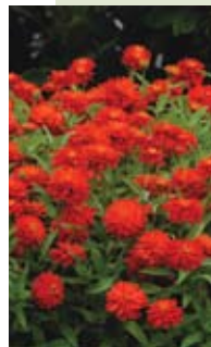
Zinnia 'Double Zahara Fire' (PanAmerican Seed, www.panamseed.com )

Like its mate 'Double Zahara Cherry', this disease-resistant variety is crowned with 2½-inch, fully double flowers. 'Double Zahara Fire' has proven leaf spot and mildew resistance. Gardeners can rely on 'Double Zahara Fire' for reliable, season-long performance. Plants will continue to bloom from spring to the end of the growing season, with little garden maintenance. Mature plants will be about 14 inches tall and spread 12 inches.