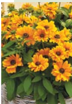
Rudbeckia 'TigerEye Gold' (Goldsmith Seeds, www.goldsmithseeds.com )

This variety grabbed the attention of voters with its prolific display of brilliant 3-inch golden blooms. Voters also appreciated the compact habit of the 16 to 24 inch tall plants. The long-lasting golden dark eyed blooms made a strong statement while showing their hybrid tolerance to heat, humidity and powdery mildew. This most popular winner guarantees fantastic season-long color in gardens, mixed containers and landscapes.