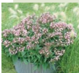
Pentas 'Northern Lights Lavender' (Benary, www.benary.com )

This petunia won because voters loved the way it brightened and blanketed the garden with its multitudes of soft yellow trumpet-shaped blooms. Voters saw that the 1½-inch blooms didn't wilt in summer's heat, humidity or rain. Blooms completely covered the 18 to 24 inch plants that didn't need deadheading or cutting back. Fast growing 'Baby Duck Yellow' spreads 30-36 inches and will rapidly fill-in gardens and containers.