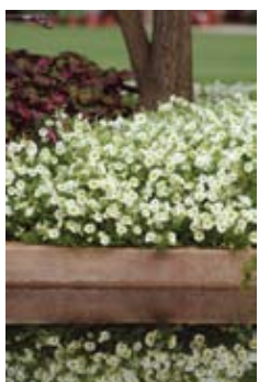
Petunia 'Baby Duck Yellow' (Ball Horticultural Co. www.ballhort.com )

This variety grabbed the attention of voters with its prolific display of brilliant 3-inch golden blooms. Voters also appreciated the compact habit of the 16 to 24 inch tall plants. The long-lasting golden dark eyed blooms made a strong statement while showing their hybrid tolerance to heat, humidity and powdery mildew. This most popular winner guarantees fantastic season-long color in gardens, mixed containers and landscapes.