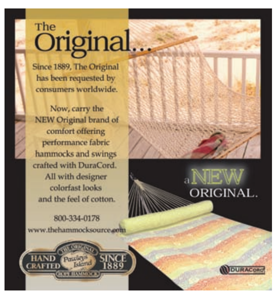
Write in 783