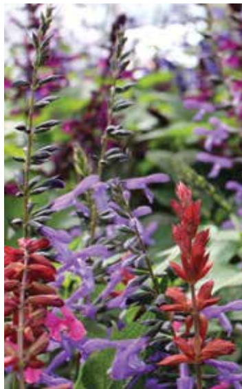
Salvia Salgoon Series HilverdaFlorist

PanAmerican Seed's Hula is a highly branched plant with many small flowers and a trailing habit that makes it a good fit for baskets and containers. It is extremely early to flower and begins to spread at an early stage. Colors include Red (shown), Pink, Blush and Bicolor (red and white).