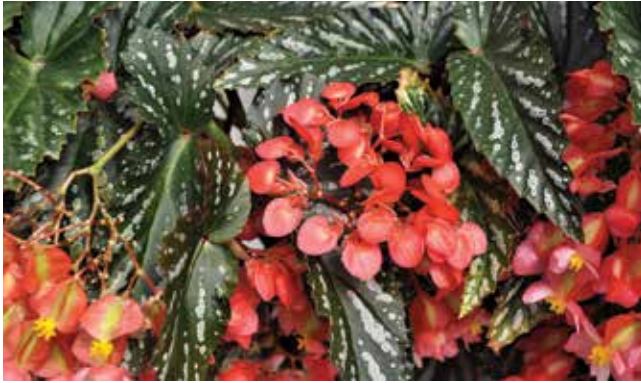
Begonia 'Citizen Cane Pink' Green Fuse Botanicals

Hybrids and other begonia innovations at CAST showed how much breeders still can do to find unique plants in the genus.