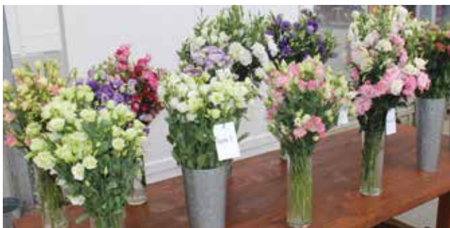
Sakata's cut flower lineup.

Syngenta Flowers showed off several varieties for its cut flower program, including snapdragons, dahlias and sunflowers. Snapdragon 'Opus III Pink' (shown) was among the cut flowers at CAST that wowed attendees. Also of interest from Syngenta were delphiniums such as the Excalibur series and zinnias 'Uproar Rose' and 'Zowie Yellow Flame'.