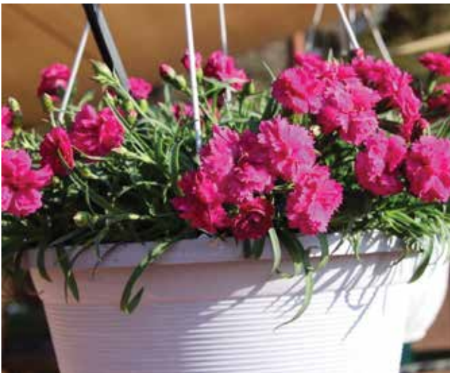
Dianthus 'Falling in Love Rosie' Ball Ingenuity

Westhoff's dianthus Best Friends Forever series is being marketed as the perfect potted gift item. Plants are loaded with flowers and available in six different colors (shown here in combo with each other). BFFs are easy to produce and continuously bloom and re-bloom with little or no effort for the grower or gardener.