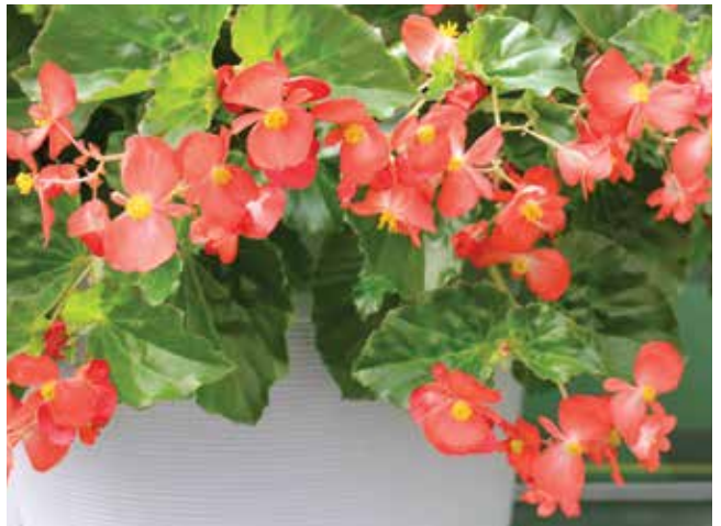
Begonia 'Hula Red' PanAmerican Seed

Salvia 'Sallyfun Blue Lagoon' from Danziger has rich, blue flowers that last through the summer season. It is a heat-tolerant salvia that has an early and uniform bloom with strong radial branching. Pollinators love it and so do home gardeners because it is easy to grow.