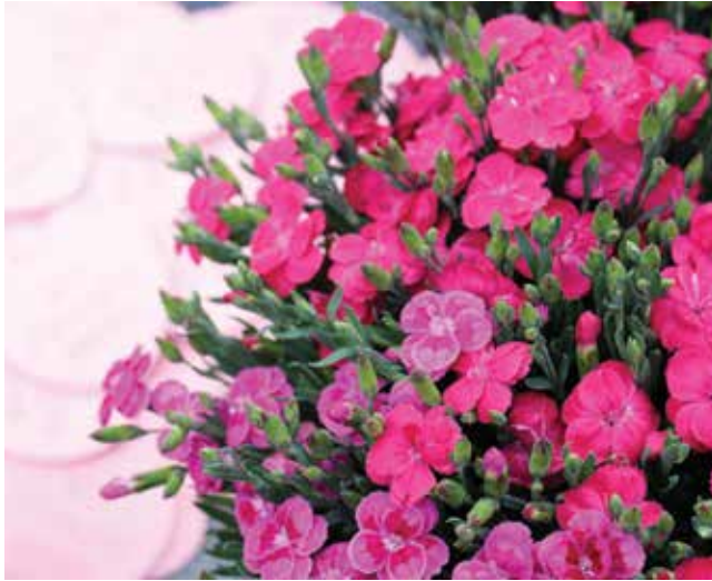
Dianthus Best Friends Forever Series Westhoff

Some of the most exciting and varied entries at CAST were in the dianthus genus, with several breeders showing off the diverse and beautiful traits of their plants.