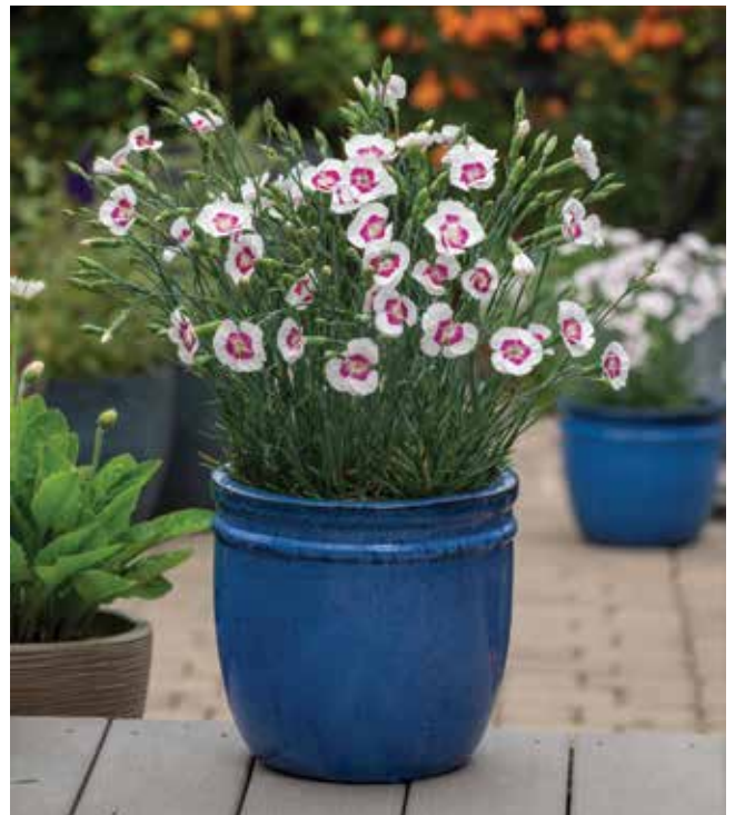
Dianthus 'American Pie Berry à la Mode' PlantHaven

Green Fuse Botanicals' dianthus 'Constant Cadence Potpourri' is full of shades of pink, rose and orange throughout the plant. Recommended for early spring through spring in containers, the variety is very heat tolerant and will continue to flower even when temperatures rise. Constant Cadence can then be planted in the garden for use as a seasonal perennial. It features "extremely unique color-changing blossoms" and is "easily programmed for year-round sales," according to Green Fuse.