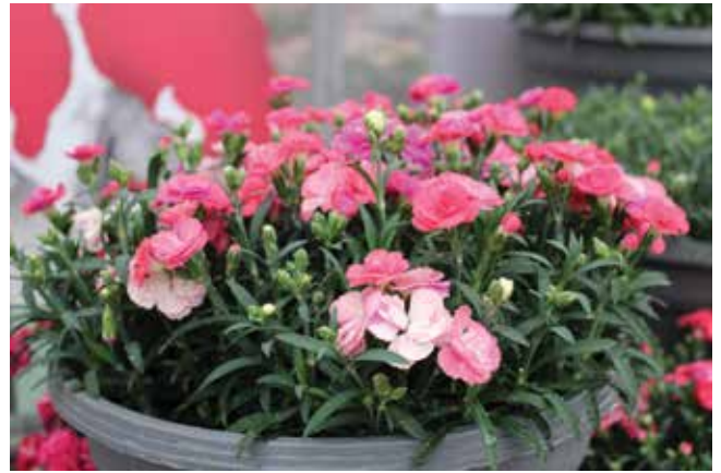
Dianthus 'Constant Cadence Potpourri' Green Fuse Botanicals

Dianthus 'Falling in Love Rosie' by Ball Ingenuity is being marketed as the first hanging basket-type dianthus on the market. It fills out its containers quickly and features beautiful bright-pink blooms that cascade over the side of containers. It offers repeat blooming from spring through summer for a lasting stream of color.