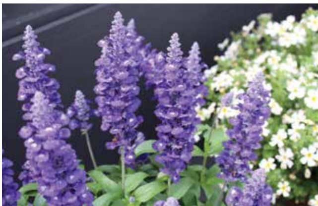
Salvia 'Sallyfun Blue Lagoon' Danziger

The diversity of the salvia genus was on display at CAST, with many breeders including unique plants in their presentations. The ability of plants in the genus to thrive under a wide range of conditions makes them a desirable choice for many gardeners.