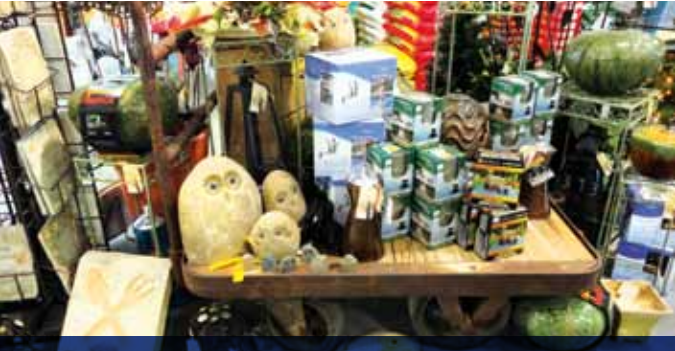
Displays on wheels at Hillermann's are seen as opportunities to easily manipulate floor space as the seasons change.

While you might use these racks to unload a delivery truck full of flats, the Bowood Farms staff finds this mobile garden pharmacy department a perfect and flexible alternative.