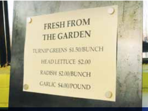
Sharing retail space and green-minded initiatives with Café Osage, Bowood Farms boasts a bi-level green roof (left) and a cool-weather hoophouse (top left) to supply residents and the cafe's kitchen with fresh and local produce.