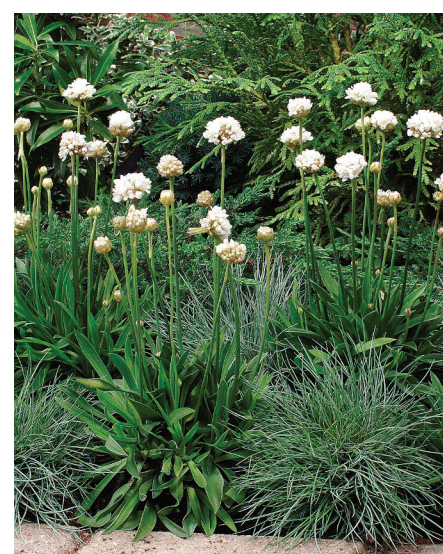
Top to bottom: 'Ballerina Red'; 'Ballerina White'.