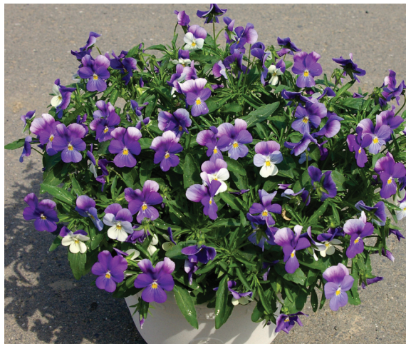
Left: 'Mardi Gras'. Top: 'Dream Come True'. Bottom: 'Rain Blue and Purple'.

Its sole function, since its foundation in 1938, has been to test new rose varieties to determine which can be recommended to the rose-buying public as rose varieties of top quality. To be chosen as an AARS Winner, a rose must complete a two-year testing process in nationwide test gardens. Rose varieties in these trials receive only as much care as the average home gardener would be likely to give.