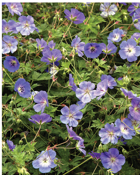
Top to bottom: 'Freelander Blue'; 'Rozanne'.

spikes of tubular flowers attract bees and butterflies. www.clause-vegseeds.com