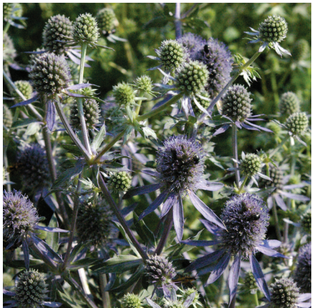
Top to bottom: 'Summer Valentine'; 'Blue Mouse Ears'; 'Blue Glitter'.