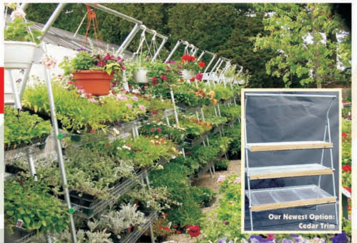
Our Newest Option: Cedar Trim

The art of retail display reaches attractive new heights with these classic-look multi-tier retail display units from Bartlett! Whether your plants would benefit from a flat-shelf two-tier or three-tier "wall-of-color" presentation...or a mixture of both...these durable displays (with basket rods) give each plant plenty of room to show off...to sell at its freshest and best!