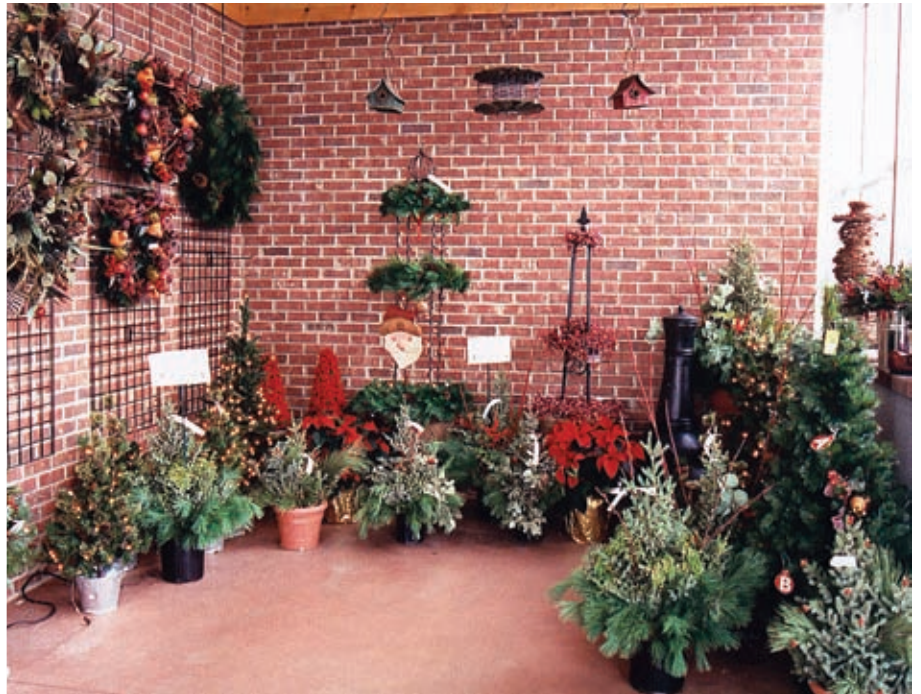
Left: This festively themed area in Pasquesi Home & Gardens presents customers with everything they'll need to decorate their own homes and create a professional, finished look. Right: Because of the large volume the store sells, Pasquesi Home & Gardens stocks a wide variety of live wreaths, trees and plants for Christmas.