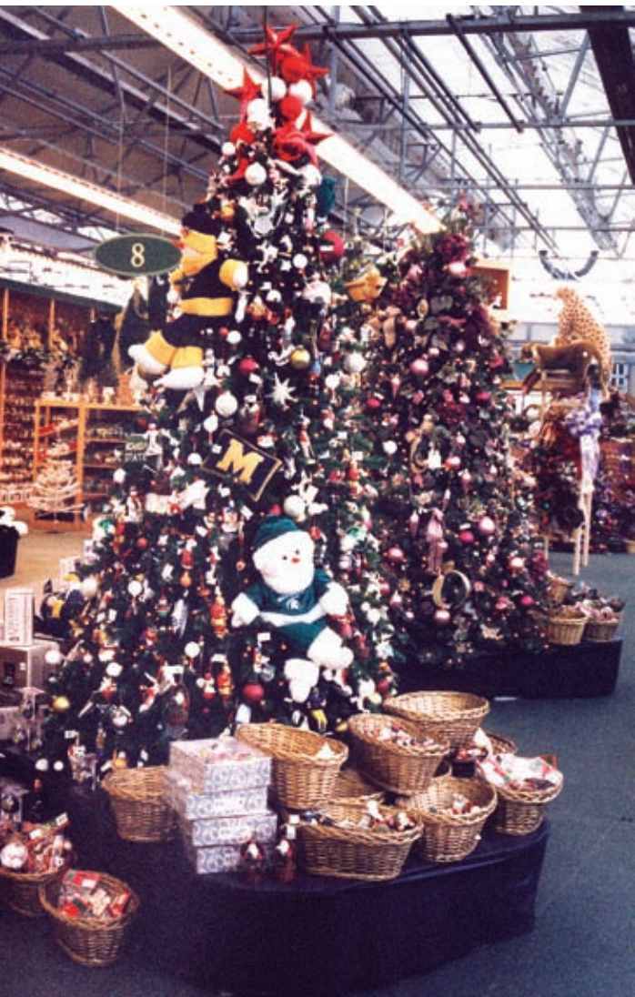
Merchandise displayed on fully decorated trees, such as this Michigan-themed tree in English Gardens, will appeal to customers.

W ith the growth of mass retailers and chain stores, the competition for Christmas merchandise dollars can seem daunting for an independent garden center (IGC). Although there has been a bit of a downward trend in consumer spending this year, the Christmas season presents a time for profitable holiday products and displays to make your merchandise stand out from the mass-produced quantities.