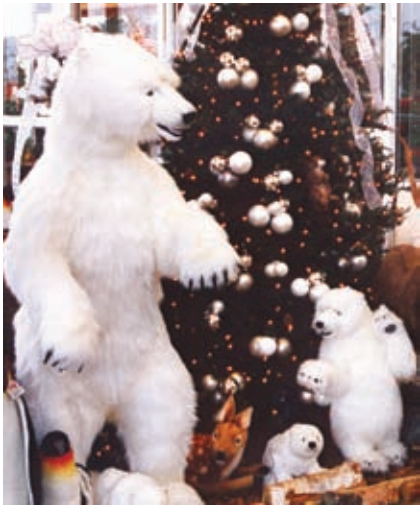
Imaginative displays, such as this one at the English Gardens, will appeal to both children and adults during their holiday shopping.

great marketing strategy around the holidays. This can create a more personal touch that isn't found in the big box stores. Some stores have opted to create Christmas displays directed toward children, with animated displays and colorful lighting. Having one-day coupons on the same day as a visit from Santa will increase traffic and encourage spending. And if children like the store and want to return, so will their parents.