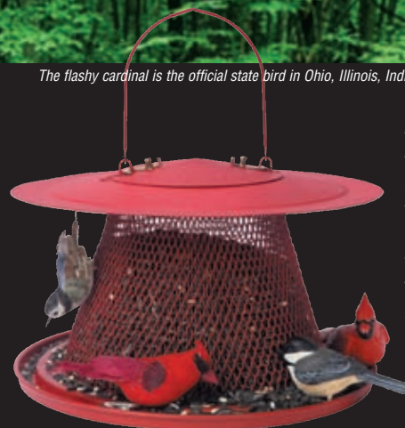
ALL-METAL NO/NO CARDINAL FEEDER

Idea: Keep No/No Cardinals on display year-round to show shoppers what makes this all-metal feeder so attractive to North America's most colorful bird!