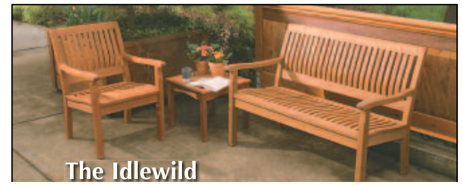
Write in 801