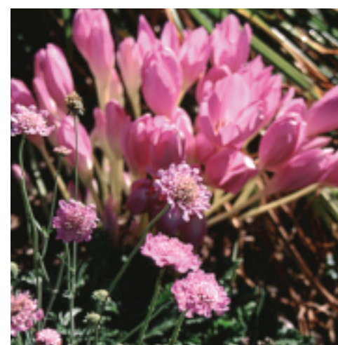
Top to bottom: Rudbeckia triloba ; Rudbeckia nitida 'Herbstonne'; Scabiosa Columbaria .

At 5-7 feet, this is not a plant for the faint of heart. However, in a large border, it makes a spectacular anchor. The exact species of this cultivar is subject to debate; Allan Armitage reports that it is probably a hybrid between R. laciniata and R. nitida . It is a sturdy plant despite its height. In the face of our often violent thunderstorms, it remains upright and strong. The flowers, a clear lemon yellow with a prominent green cone, are large and borne over an exceptionally long bloom period. Stretching until well after Labor Day, this lofty flower display helps fill the border. No major insect pests seem to bother it. Rabbits are interested in the young plants, so some protection may be useful in the spring.