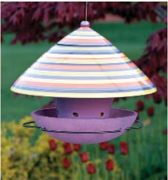
Bird feeder The Saucer Bird Feeder is made from hand-painted ceramic with a colorful, modern stripe design. The top lifts off for easy filling. BirdBrain, Inc. (800) 289-4748. Write in 1410