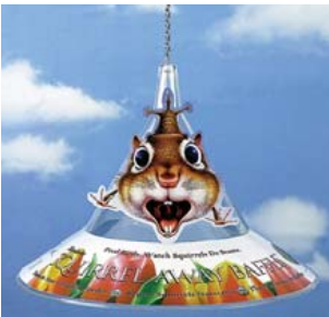
Squirrel baffle The Squirrel-Away Baffle keeps squirrels on the ground and out of the bird feeder. It will provide hours of entertainment, as stubborn squirrels attempt to balance themselves and get to the seed, but every time they will slide off the edge, away from the seed. Arundale Products. (314) 652-1220. Write in 1404