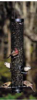
Bird feeder Classic Tubular Bird Feeders have been updated with a polished pewter finish. This powder-coated finish will not pit, chip or tarnish and is durable and attractive. The Classics include several sizes of Sunflower feeders. The Classic Nyjer feeders feature the Droll Yankees signature armor bands to protect against squirrels and carries a lifetime warranty. Droll Yankees Inc. (800) 352-9164. Write in 1412