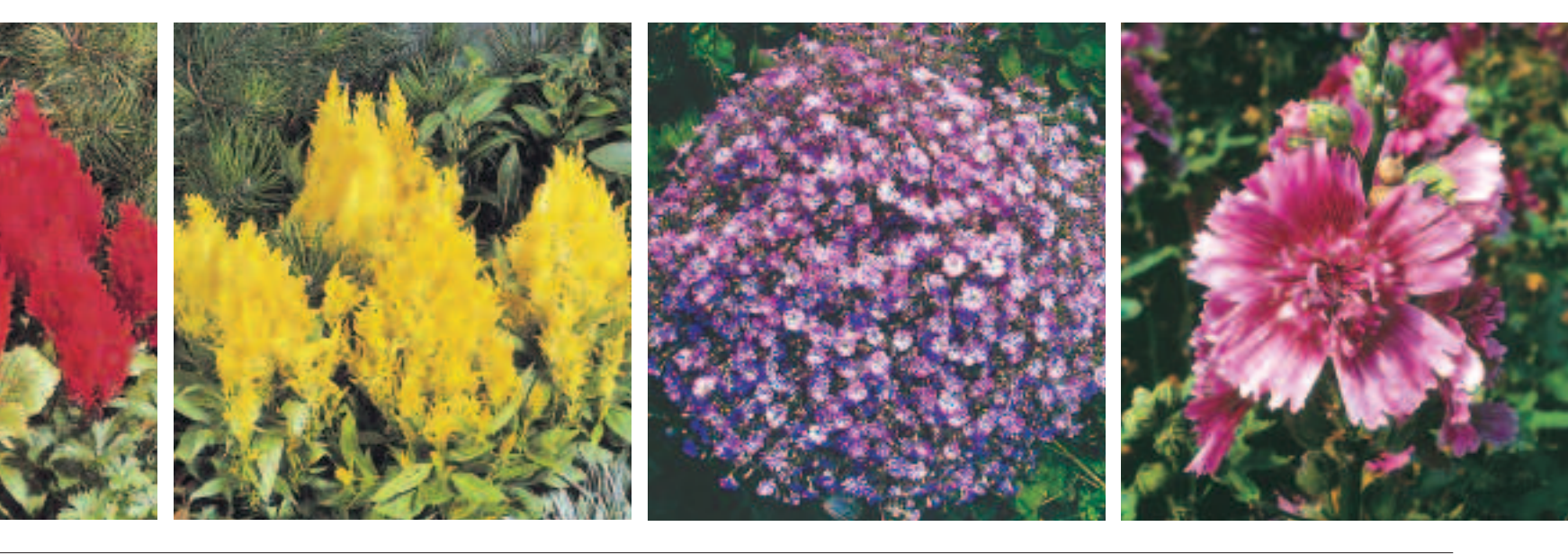
Left to right: celosia 'Fresh Look Red'; celosia 'Fresh Look Yellow'; gypsophila 'Gypsy Deep Rose'; hollyhock 'Queen Purple'.