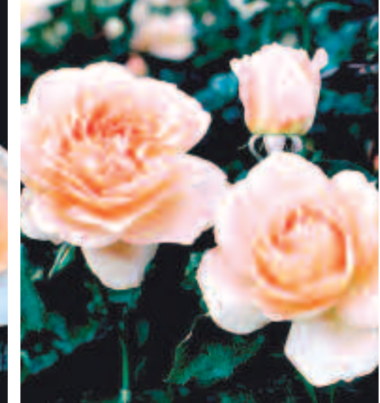
Left to right: 'Day Breaker'; 'Honey Perfume'; 'Memorial Day'; coreopsis 'Heliot'.