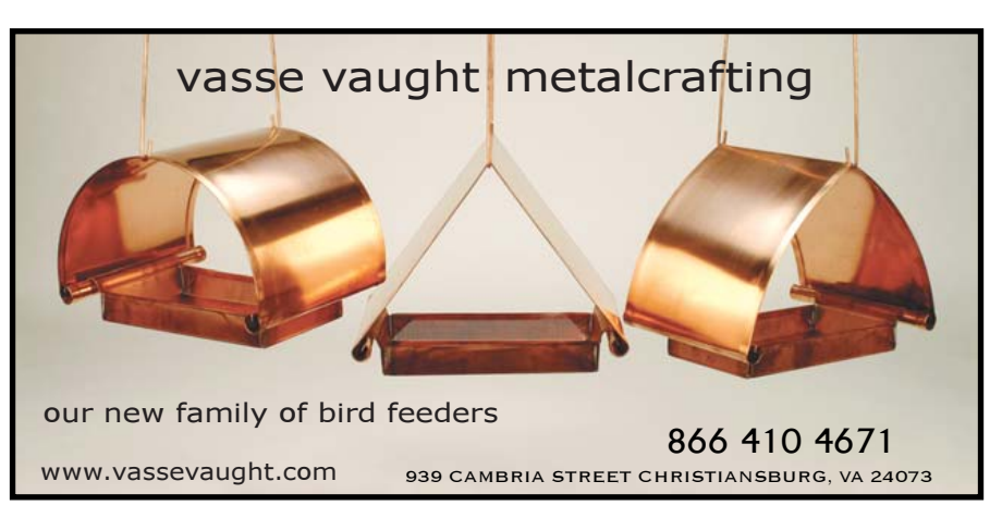
Write in 853