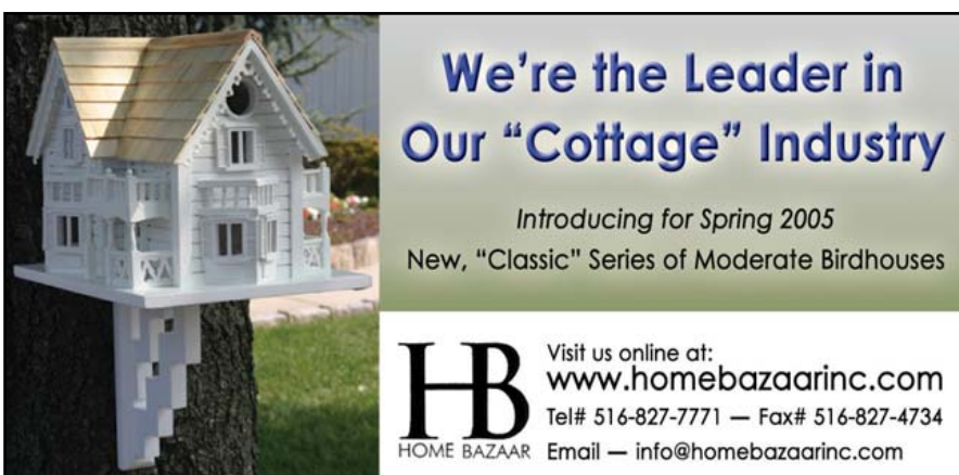
Write in 805