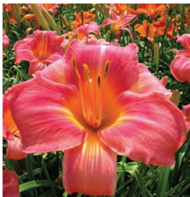
Daylily 'Persian Market'