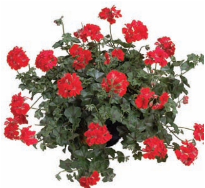
Geranium 'Global Red'

Ivy geranium 'Global Red' has dark-green foliage and was bred to provide a large number of flowers. It grows well in a 4½-inch format using