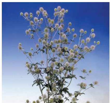
Eryngium 'Blue Glitter'