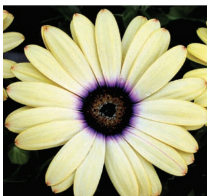
Osteospermum 'Kenai Grande Pineapple'