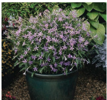
Laurentia 'Avant-garde Blue'