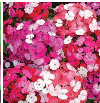
Dianthus 'Noverna Clown'