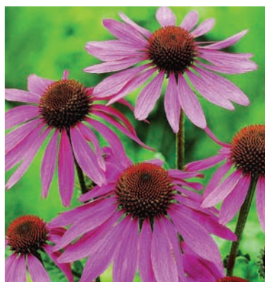
Echinacea 'Prairie Splendor'