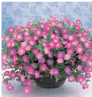
Petunia 'Opera Supreme Pink Morn'