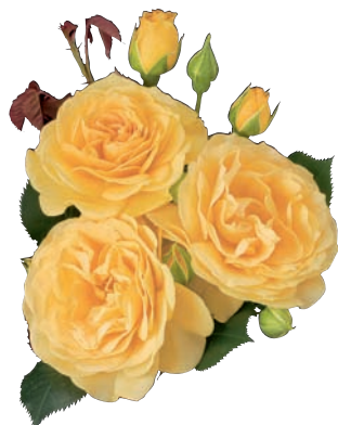
Floribunda rose 'Julia Child'