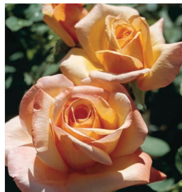
Hybrid tea rose 'Tahitian Sunset'