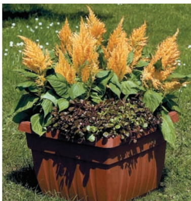
Celosia 'Fresh Look Gold'