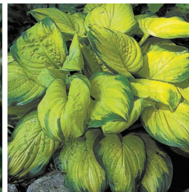
Hosta 'Stained Glass'