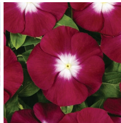
Vinca 'Pacifica Burgundy Halo'