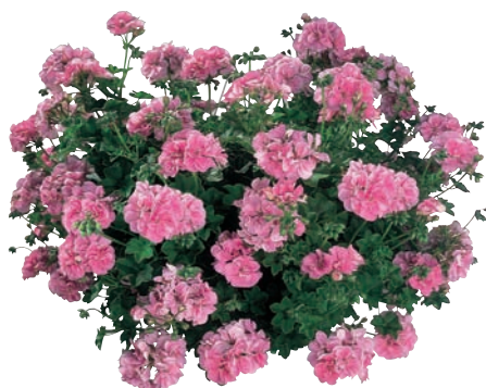
Geranium 'Royal Light Pink'