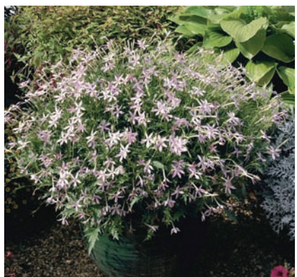
Laurentia 'Avant-garde Pink'