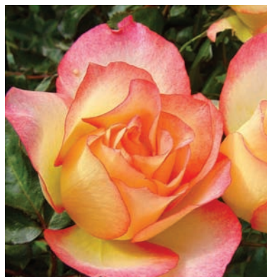
Floribunda rose 'Rainbow Sorbet'