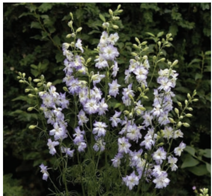
Delphinium 'Sydney Blue Picotee'