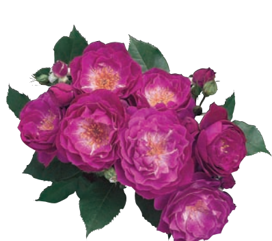
Grandiflora rose 'Wild Blue Yonder'

American Ivy Society began the "Ivy of the Year" program in 2001. Since then, the society has looked ▶