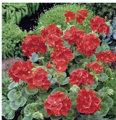
Geranium 'Infiniti Scarlet'