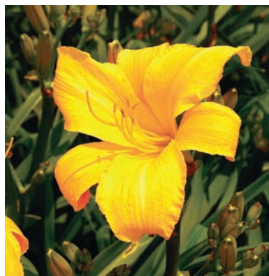
Daylily 'Buttered Popcorn'

'Julia Child' (Weeks Roses). Julia Child picked this floribunda rose to bear her name. Its butter-gold petals blend in well with light-colored landscapes. These free-