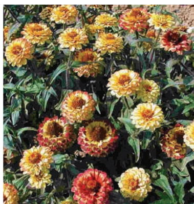
Zinnia 'Aztec Sunset'