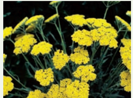
Clockwise from left: Physostegia 'Crystal Peak'; Hydrangea 'Hamburg'; Achillea 'Coronation Gold'

who know a thing or two about hardscapes.