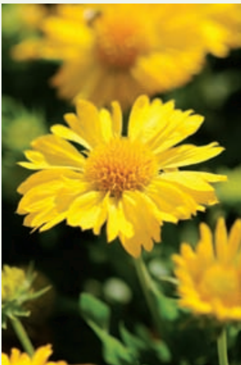
Gaillardia 'Mesa Yellow'