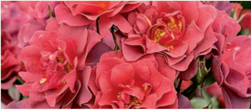
Rose 'Cinco de Mayo'