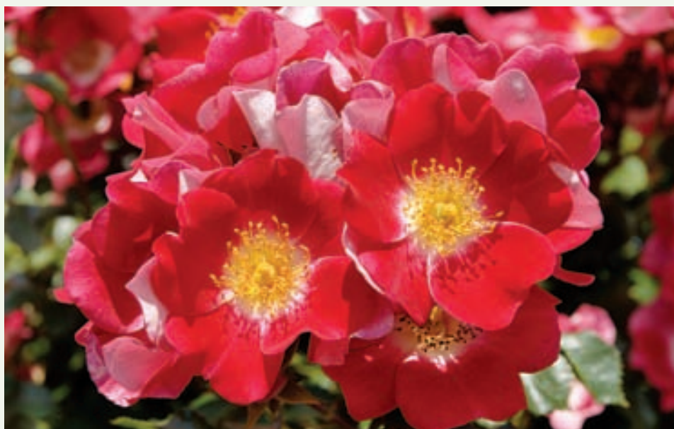
Left: Rose 'Pink Promise'. Above: Rose 'Carefree Spirit'.

'Carefree Spirit' (Conard-Pyle Co., www.conard-pyle.com ). Recognizing that consumers want roses that are easy to care for, in 2004, AARS stopped spraying fungicides on all shrub roses in its test gardens. 'Carefree Spirit' is the first and only landscape shrub to date to endure this testing and prevail as a winner. This mounding rose produces deep-red blossoms with white twinkles in their eyes. This