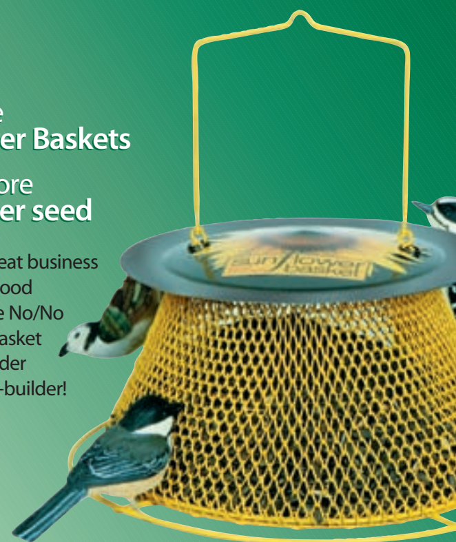
Sunflower Basket all-metal wire mesh feeder

Building repeat business is a goal of good retailing. The No/No Sunflower Basket wild bird feeder is a business-builder!