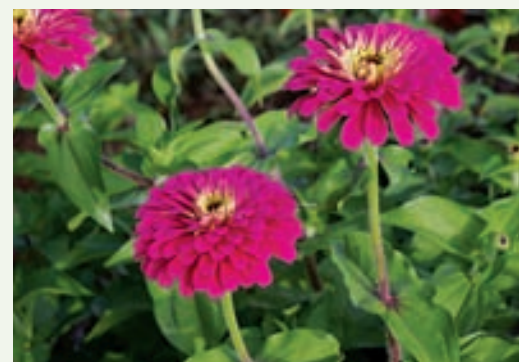
Zinnia 'Uproar Rose'

'Dream Souffle'. The fluffy double-petaled blooms of 'Dream Souffle' are a pastel rose-pink blended with cream and flushed with yellow in the center. It blooms mid-season at 24-30 inches in height above 16-20 inch arching green deciduous foliage. It then repeat blooms, giving a total bloom period ranging from 30 to 80 days per year. This variety is recommended for USDA Zones 4 through 10.