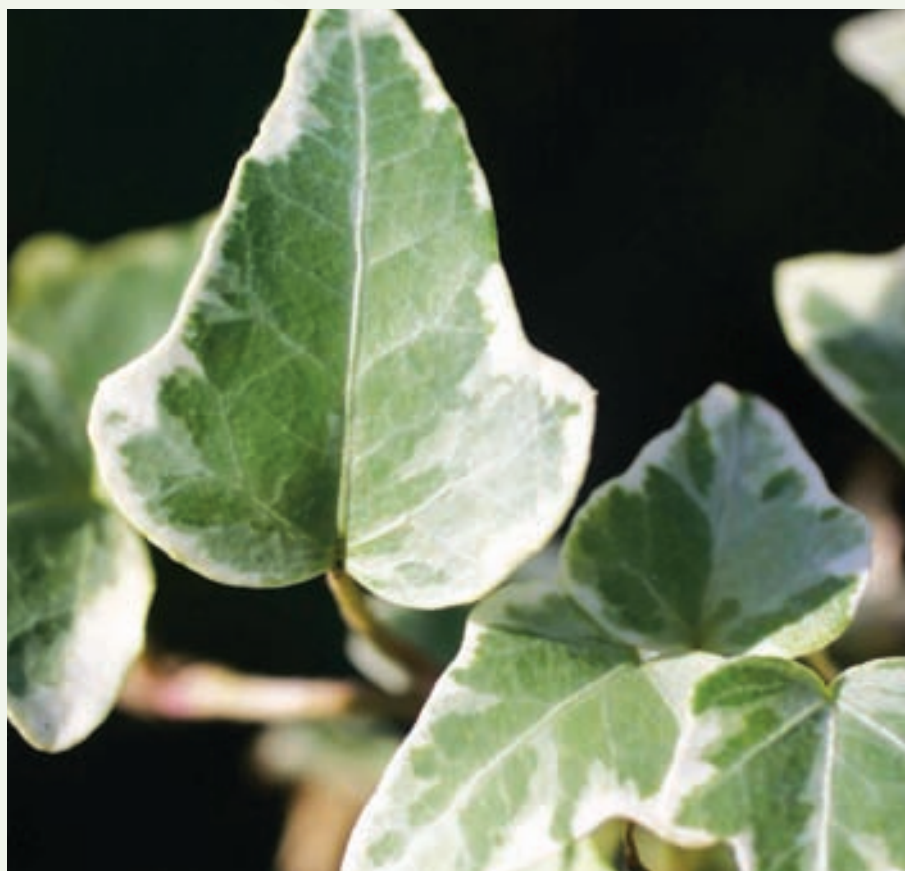
Hedera helix 'Eva'

egory, is resistant to leaf spot and mildew. The single rose and white 2-inch blooms are attractive and encourage impulse sales. Gardeners will find these zinnia plants mature at 12-14 inches, tolerating hot and dry or wet summer growing conditions. AAS judges noted exceptional garden performance in spite of higher than normal rainfall. It provided continuous flower color with minimal plant care.