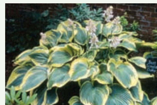
From top: Snapdragon 'Twinny Peach'; Daylily 'Dream Souffle'; Hosta 'Earth Angel'